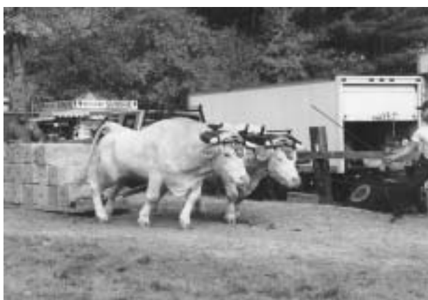
Figure 7 Head yoke cattle in competition

The neck yoke design used in the United States has not been static for centuries, as have other designs in the developed world. In New England, ox competitions have challenged ox teamsters continuously for 200 years to maximize the comfort of the animals in order to get peak performance (Welsch 1994). As a result the yokes are continually being improved and perfected. This paper will highlight the fit, design and steps in making a neck yoke. This system is culturally biased, but understanding this system and the comfort it provides for the animals offers many possibilities to improving other yoke designs.