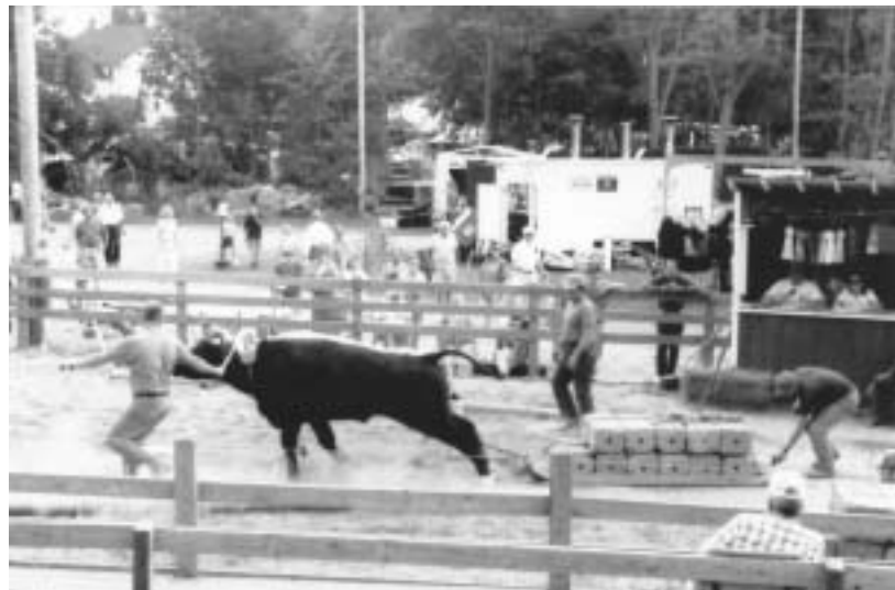
Figure 6 Competitions in the USA kept this cultural tradition alive and forced teamsters to make yoke comfort a top priority

New England is the only region in the United States with farmers who have continuously maintained the tradition of using oxen to this day. This is where I gained my early experience with oxen. The use of ox technology reflected the poverty and land in this region, as well as the stubborn cultural adherence to a system the farmers understood (Bunting 1986, Conroy 1999). Most ox teamsters today in the United States keep oxen for fun and competition (Suits-Smith 1997, Conroy 1999). iii The use of the English neck-yoke technology reflects a local sub-culture, regional geography, and a strong cultural tradition of how to “properly” train and use oxen.