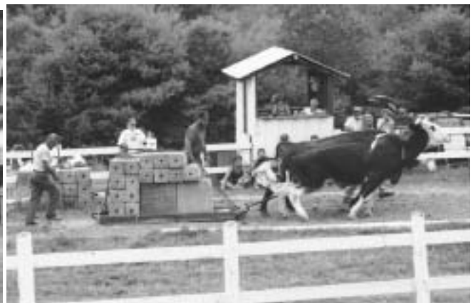
Figure 8 Neck yoke oxen in competition