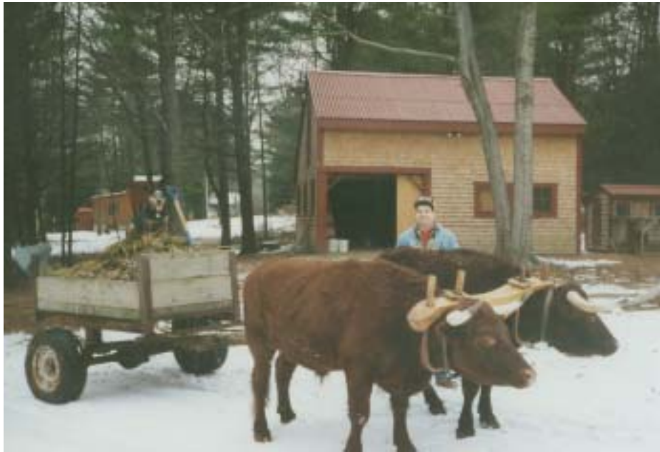
Figure 1 The author with his own oxen hauling a cart of manure.

grounded in cultural history and tradition. I learned how to drive oxen from ox teamsters who had passed this traditional skill along informally through the generations. I took this interest in oxen, and learned to appreciate other yoking systems, cultural preferences, and ultimately did formal research in East Africa on the adoption of oxen by the Maasai culture, new adopters of animal traction. Like many cultures before them, the Maasai have been forced to change their semi-nomadic lifestyle. Crop based agriculture has become an important part of their local economy. Like many cultures before them, the Maasai were forced to seek out additional power for field preparation and transport. Being prominent pastoralists, they quickly and successfully adopted animal traction out of necessity. However, even among the Maasai, the wounds caused by ox yokes were troublesome.